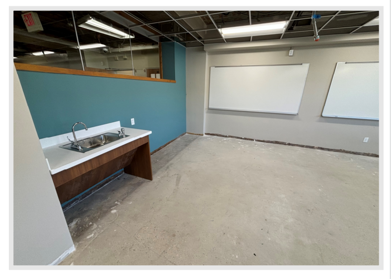
Painting has been finished and casework is following in 1st floor phased classrooms!